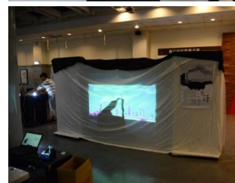
Figure 3. Students' works- Masks outside the world and south thin

The concept of this work mainly shows man-made pollution by smoky smoke and haze. The device, which is quite large in size, uses three layers of translucent cloth and images to allow the viewer to feel visual, tactile and smell when using the device. The students used three layers of cloth of different thickness and texture, and the taste of the cloth concept.