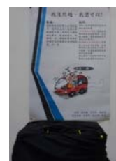
Figure 2. Students’ works-Think YELL and No problem

The usage of the game screen to express the state of drunkenness. Through the image processing to express the state of drunkenness, it is presented in line with current affairs to simulate the situation after drinking wary of not drunk driving. Creative Techniques: Averaging filters for different mask sizes.