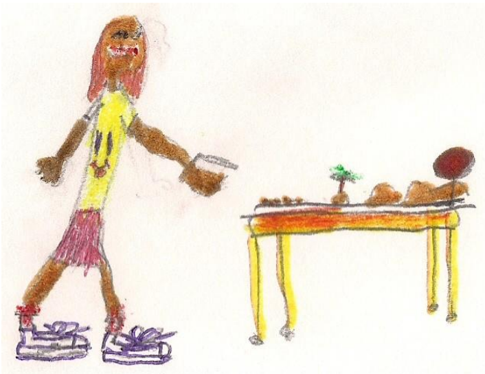
Figure 2. Example of a drawing that depicts a student-centered science classroom

I'm a student, and the bubbles show the vinegar is being boiled. There is fire. I love drawing...I love science.