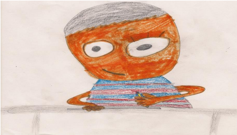
Just me writing about science

None of the children drew themselves with an unhappy face (Table 8). Some of the children (24%) drew themselves with a neutral emotion (neither happy nor unhappy) on their faces. An example of a drawing that showed students with a neutral emotion faces is presented in Figure 7.