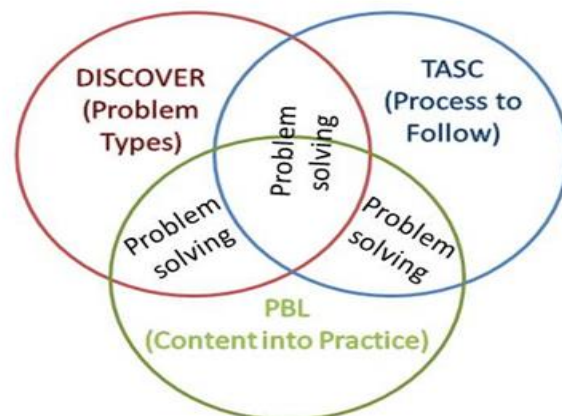
Figure 1. The Model REAPS

The main reason why the REAPS Model was selected for this study was because REAPS model not only was a framework for teachers to guide students throughout