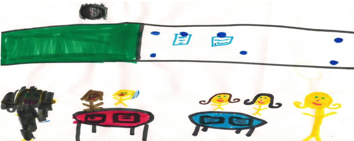
Me and my group doing a science project