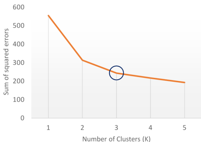
Figure 1. K-means clustering SSE vs. number of clusters

Note: Means with different superscripts are significant at p < 0.05 based on Scheffe post-hoc tests for equal variances. STEM interest measures range from 1 = "Not interested" to 5 = "Very interested."