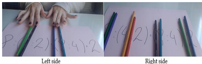
Figure 4. Meanings of material on each side of equality (PST#25)

During the video, PST#4 represents the cardinal of each set of matches 8, 4, and 2, twice, once for each side of equality and describes the following: