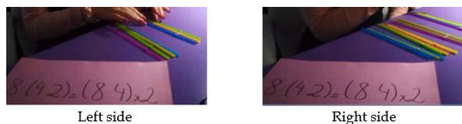
Figure 7. Final representations on each side of equality of PST#8

Subsequently, for the second part of equality, he says: