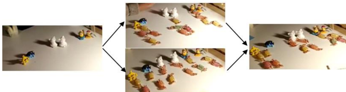
Figure 8. Material used by PST#1

arithmetically and 14.8% only by means of the material. Only 11.1% of the PSTs did not check the property at all.