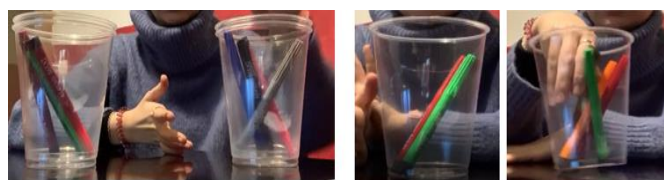
Figure 5. Meanings of material on each side of equality (PST#2)