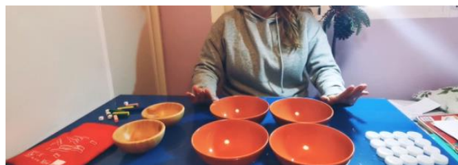
Figure 6. Material used by PST #16

Some of the PSTs use the selected material only to represent the numerical values assigned to the indeterminates and the results of the intermediate operations (Figure 3), placing as many objects as indicated by each number that appears (25.9% of the total). All these PSTs use the same material for the representation of all the indeterminates present in the property. For example, PST#22 uses only some pieces of