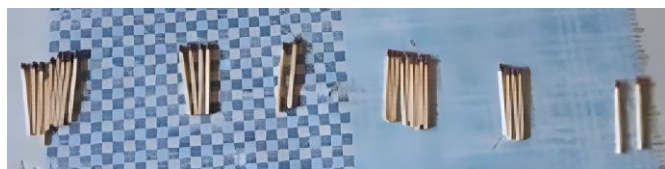
Figure 2. Use of materials without context (PST#4)

pose a contextualized situation, we expect it to be a word-problem (Borasi, 1986): an explicit context, a unique solution, and a resolution by combining known algorithms.