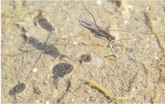
Figure 5. The shadow of water striders (the picture in the habit, the rice field)