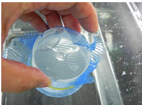
Figure 2. Mesh net & Cup-induced surface tension experiment

In the 'Prediction' step, teachers enabled students to plan from the question of 'Do clips float in the water?' to the question of 'How do we make clips float in the water?' Then they are tasked to carry out the method of 'How we make clips float in the water.' Teachers enabled students to prepare one clip and a piece of paper which was a little wider than the clip. They then challenged students to fill the cup with water, and float the paper in water at first. Teachers inspired students to put the clip on top of the paper lightly and to push the paper slightly by a pencil or finger tips to sink the paper. Teachers then endorsed students to observe what happen. They suggested students induce a thorough planning because of this activity with several times trial-and-error possibility.