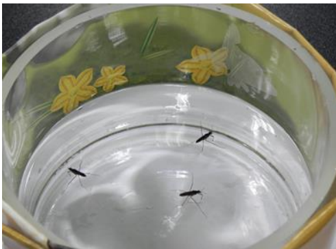
Figure 6. In the activity of finding out water striders' cognitive ability

addition, Teachers provided students with the opportunity to sum up what they wanted to know about the water strider's eyes.