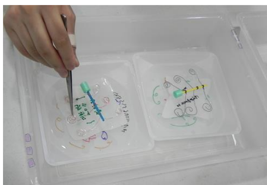
Figure 7. The activity of 'Making a water strider's model'

tell the students to make a water strider's more specific model by using Styrofoam, wire, sponge.