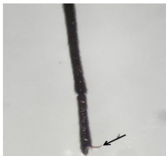
Figure 4. Water striders' claws (Observed with stereoscopic microscope)

surface as well as a larger surface area to spread their weight over the water. The front legs are the shortest and have preapical adapted to puncture prey. The reason the leg does not fall into the water is because of the oily water from oil glands, or sebaceous glands, in the end of claws which prevents the hairs from wetting.