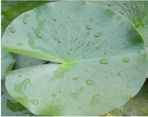
Figure 8. A lotus leaf’s surface tension