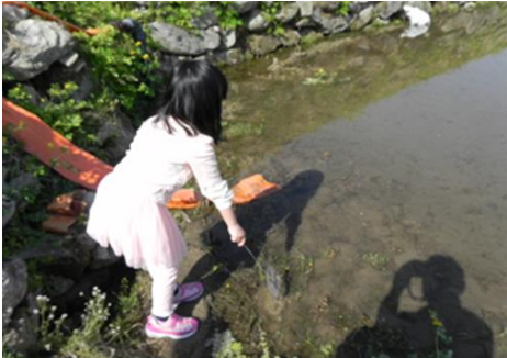
Figure 3. The picture of the child who is grabbing a Water Strider

Students could capture Water Striders by fishing without the use of a scoop net. Students tied dragonflies and ants to a thread as a bait and then made them float on the water. When a water strider approached, and attacked the insect, students dragged up the line and caught them. Figure 3 is the picture of the child who is seizing a water strider.