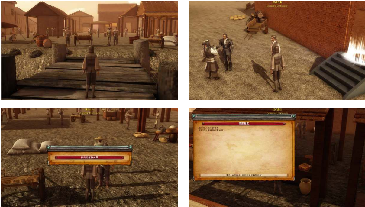
Figure 2. Digital game setting