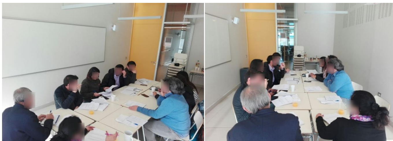
Figure 2. Focus group session with participating teachers