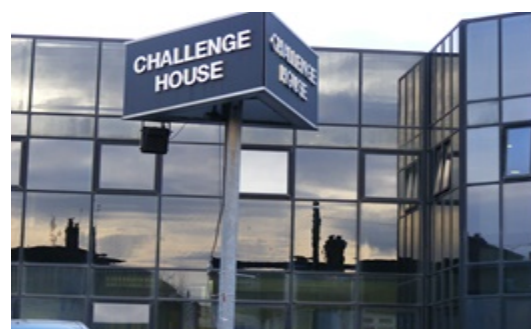
Challenge House Business Centre

Published by: MODESTUM LIMITED Publication Office: Suite 124 Challenge House 616 Mitcham Road, CRO 3AA, Croydon, London, UK Phone: + 44 (0) 208 936 7681 Email: publications@modestum.co.uk Publisher: http://modestum.co.uk Journal Web: http://www.ejmste.com Twitter: https://twitter.com/ejmste Facebook: https://www.facebook.com/ejmste